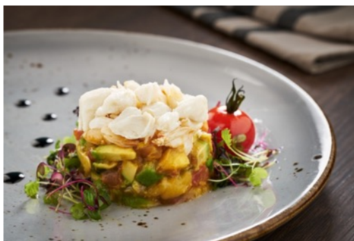
CRAB & MANGO STACK ($18++)

If the Southern Waterfront view has you craving seafood, what about some oysters? Seasonally sourced, and perfectly plump, they are steeped in herb-infused white wine sauce and topped with salty pearls of ikura.