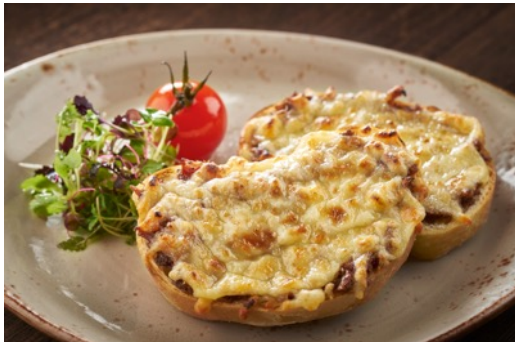
DUCK RILLETTE AU GRATIN ($22++)

A signature dish from the French Périgord region Chef Kenny picked up during his time there, Duck Rilette Au Gratin is made up of slow-cooked duck shredded onto slices of Ciabatta bread. Tender and moist from being cooked at a low temperature for seven hours overnight, the duck is blanketed with a warm layer of cheese and served with a side salad.