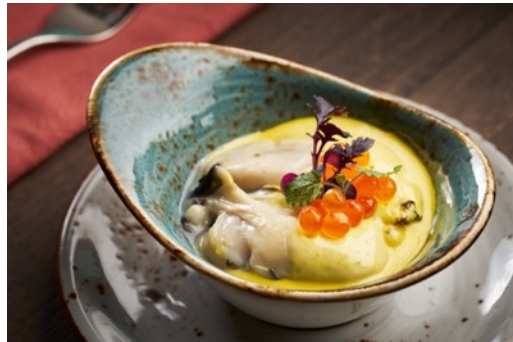
WINE POACHED OYSTERS ($22++)

A signature dish from the French Périgord region Chef Kenny picked up during his time there, Duck Rilette Au Gratin is made up of slow-cooked duck shredded onto slices of Ciabatta bread. Tender and moist from being cooked at a low temperature for seven hours overnight, the duck is blanketed with a warm layer of cheese and served with a side salad.