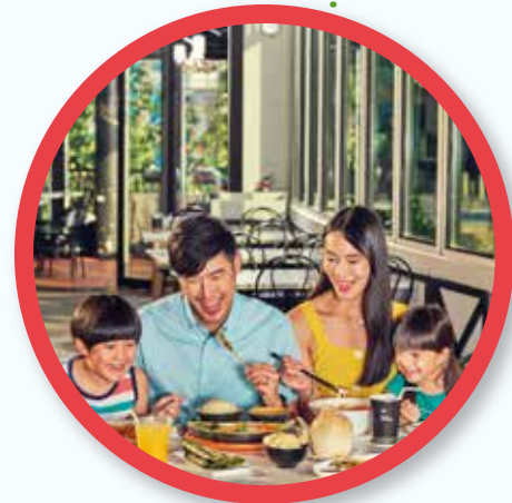
Lunch at Good Old Days