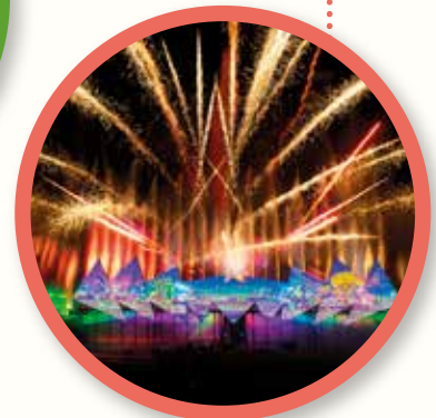
Wings of Time Night show