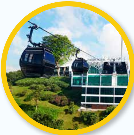
Mount Faber Line