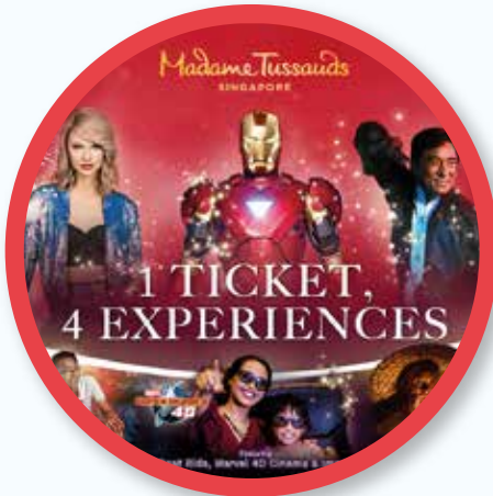
Madame Tussauds Singapore