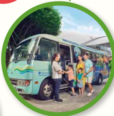
Sentosa Island Bus Tour