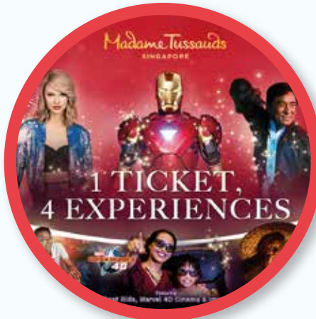
Madame Tussauds Singapore