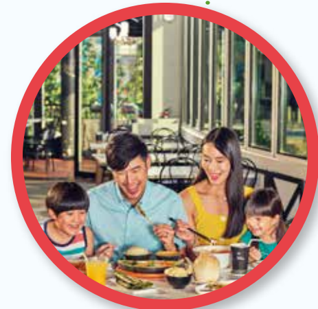
Lunch at Good Old Days