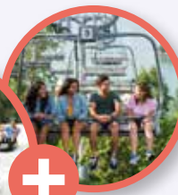
2 Luge + Skyride Combo