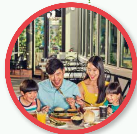
Lunch at Good Old Days