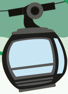
Mount Faber Line