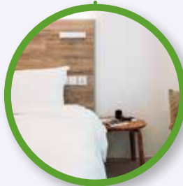
Check-in to hotel, rest and relax