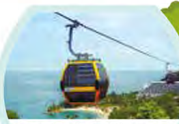
Cable Car Ride on Sentosa Line