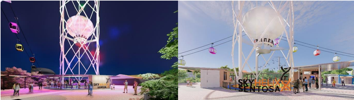
Artist's impressions of SkyHelix Sentosa

To safeguard the health and safety of guests, SkyHelix Sentosa is available for vaccinated guests only, and accompanying children under 12 years old. Prevailing Safe Management Measures (SMM), such as group size limits and rigorous sanitising regimes, will be implemented. Guests may reserve their visit date and time slot when purchasing tickets. Members of Mount Faber Leisure Group's Faber Licence annual membership programme will enjoy a 20% discount on tickets year round.