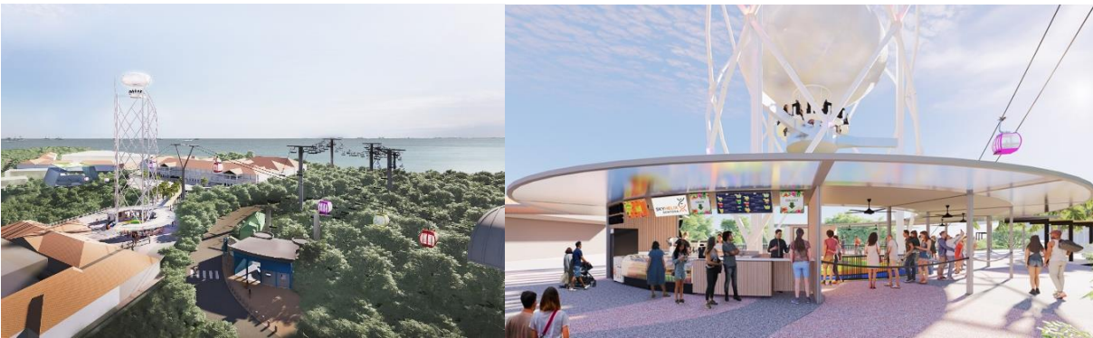
Artist's impressions of SkyHelix Sentosa