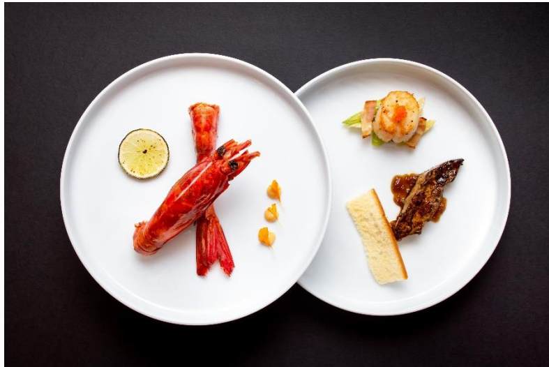
Appetisers – Spanish Carabinero Red Prawn (L), Pan-seared Hokkaido Scallop and Hong Shao Glazed Foie Gras (R)

The smorgasbord of flavours does not stop there – taste one of Europe's most premium ingredients, foie gras, like never before. Slow cooked on a low temperature using the traditional Chinese braising technique of hong shao (or red cooking), it is served with a medley of aromatic Asian spices, onion marmalade and brioche, bringing together the best of European and Asian cuisines in a mouth-watering delight to the senses. Next is the Scallop Dumpling served in a warm and savoury seafood broth with porcini dust and white truffle oil.