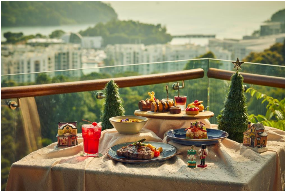
Indulge in Arbora Hilltop Garden & Bistro's Festive Menu Delights